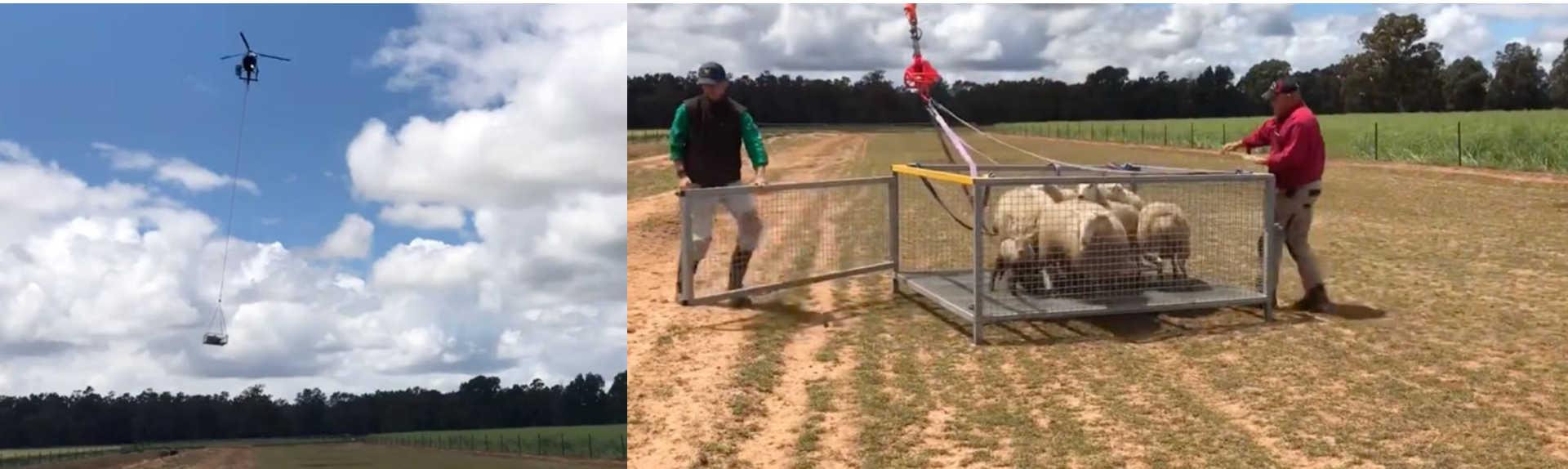
AASFA relocating sheep using a helicopter and crate