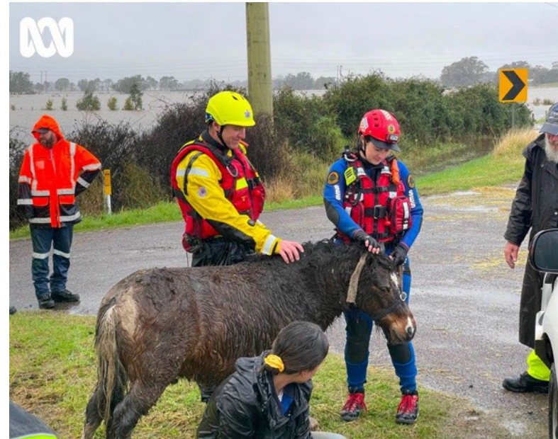
3 x miniature horses rescued from Miller's Forest (Hunter)