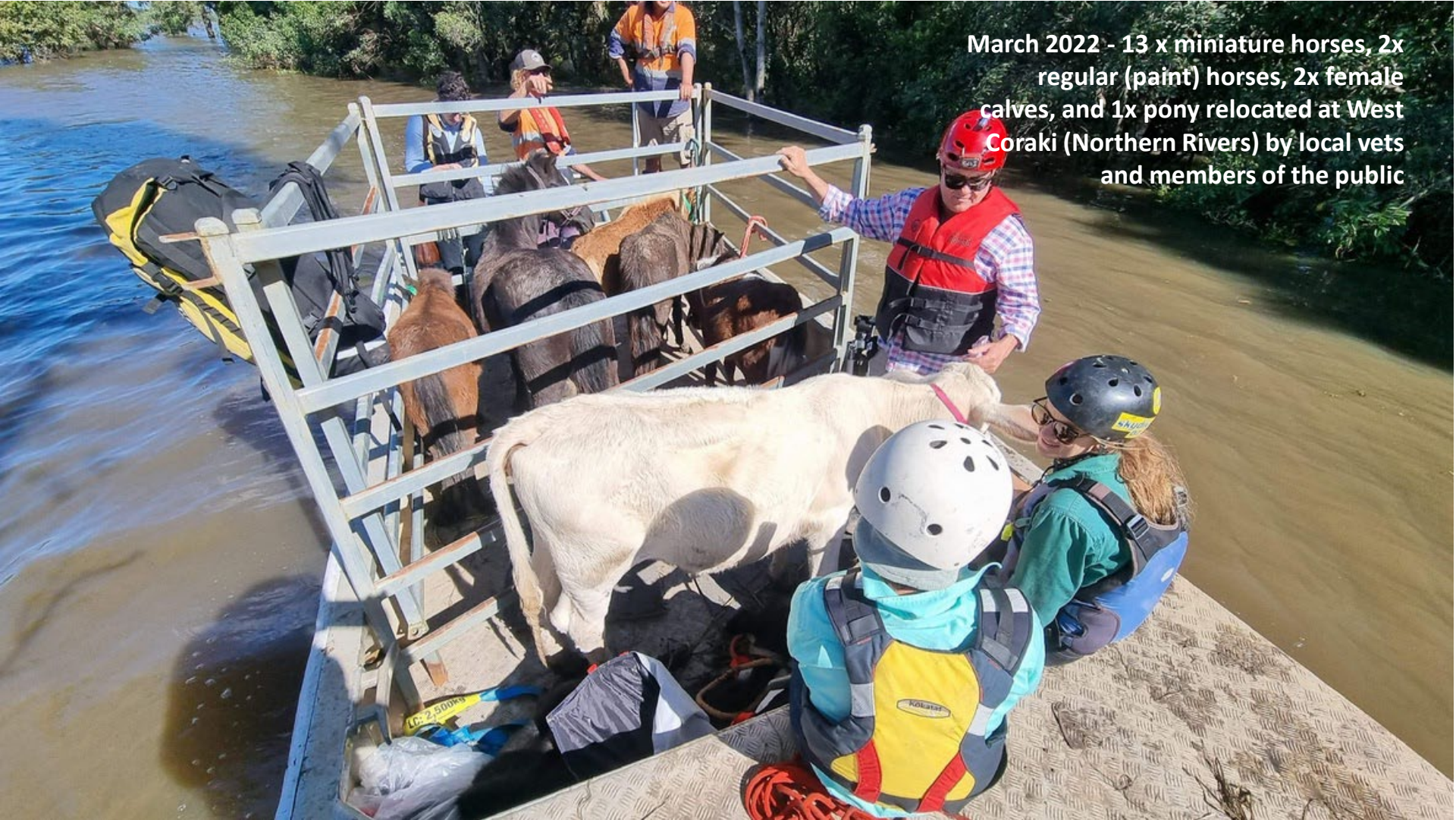
March 2022 - 13 x miniature horses, 2x regular (paint) horses, 2x female calves, and 1x pony relocated at West Coraki (Northern Rivers) by local vets and members of the public