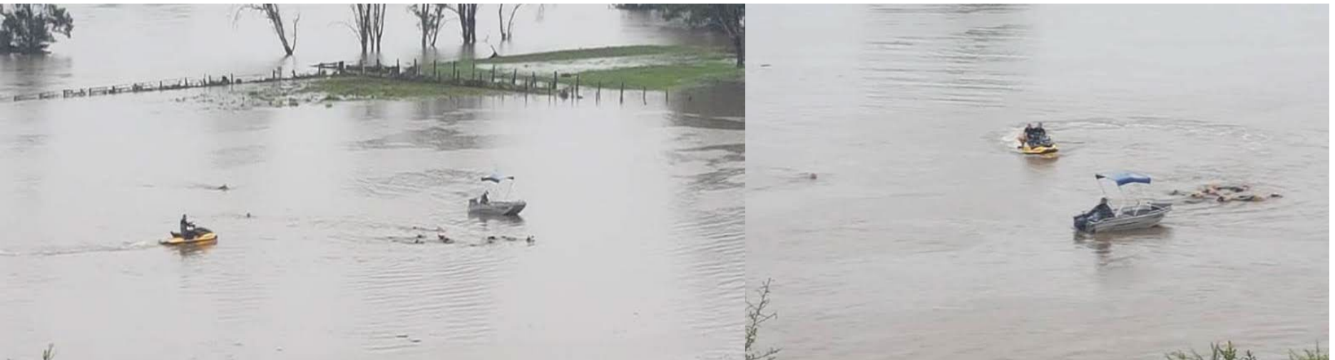
March 2022 -members of the public on jet-skis rescuing cattle (Hawkesbury-Nepean)

“If our emergency services don’t respond to requests to relocate or rescue animals from flood waters, the public will. ”