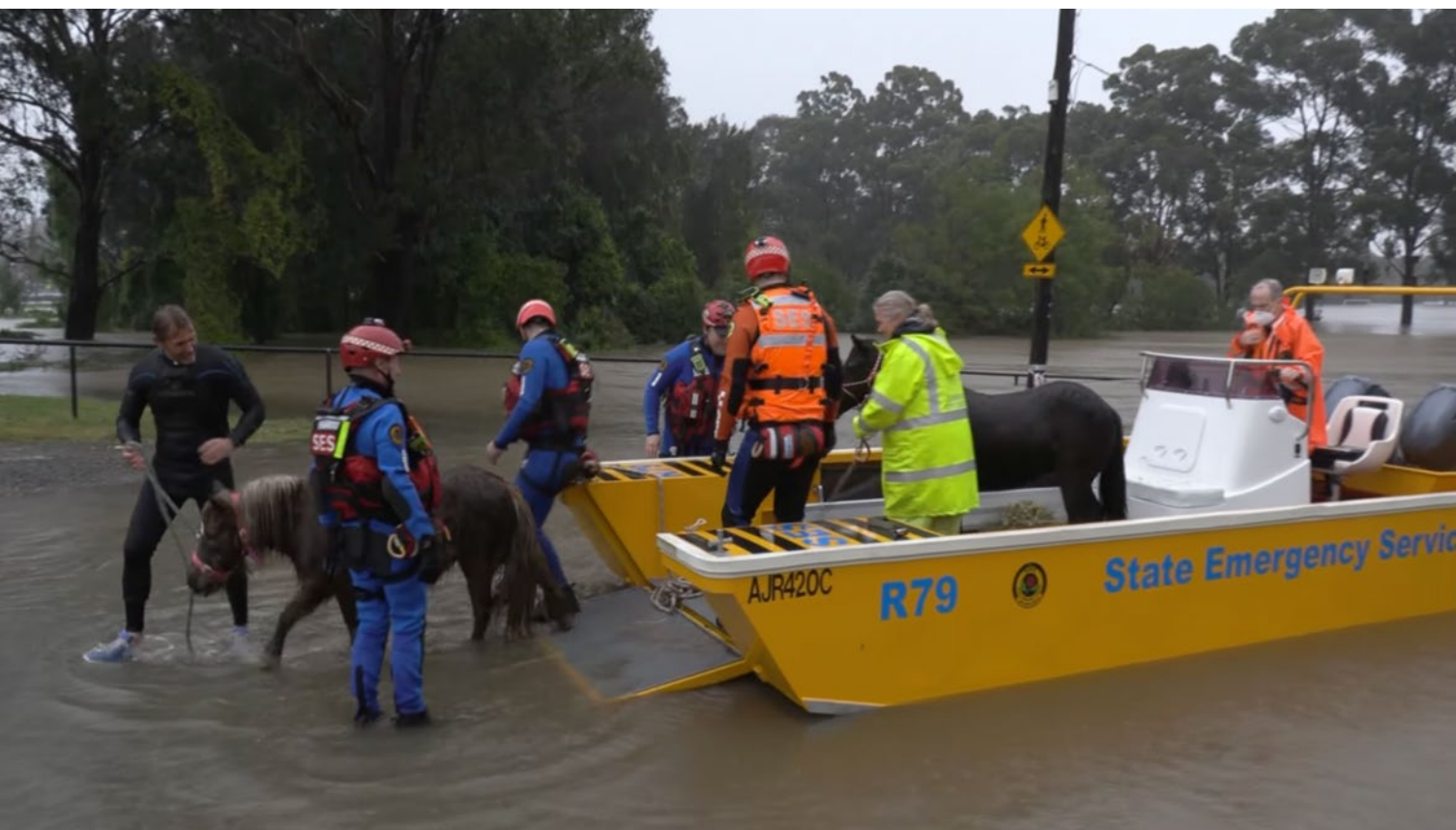
2 horses from Moorebank (George's River)