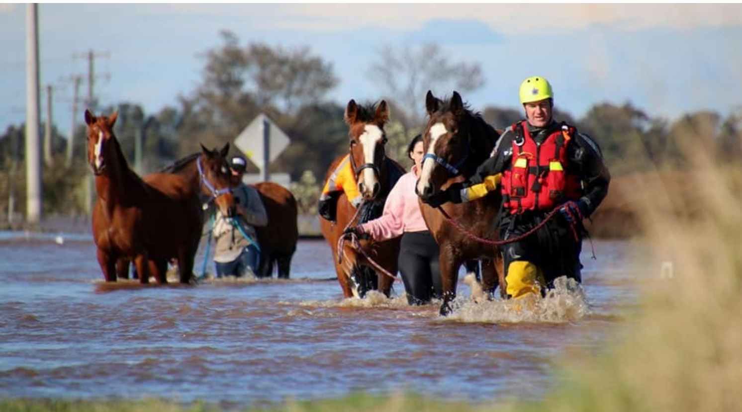
20 horses rescued at Miller's Forest (Hunter)