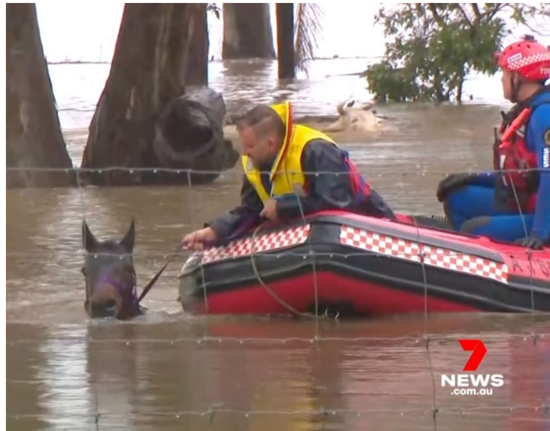
3 horses and 5 cattle rescued from Berkshire Park (Hawkesbury-Nepean)