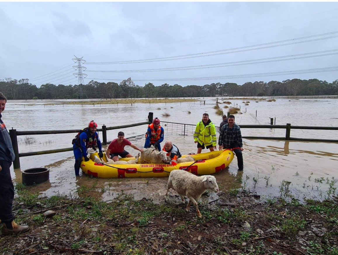
8 sheep rescued at Llandilo (Hawkesbury-Nepean)