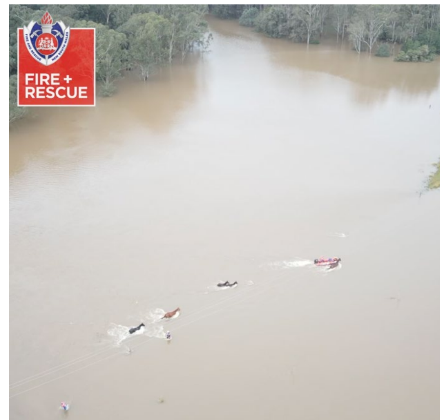
6 horses rescued at Sackville North (Hawkesbury-Nepean)