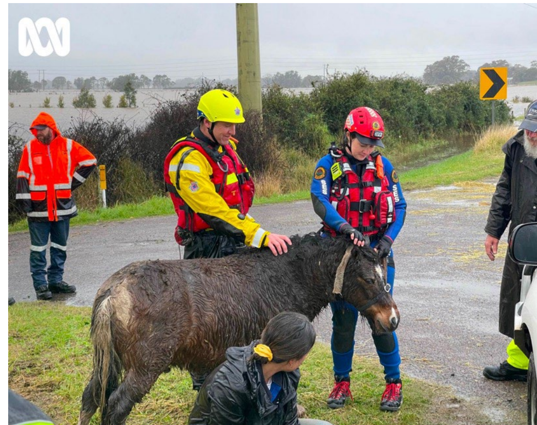
3 miniature horses rescued from Miller's Forest (Hunter)