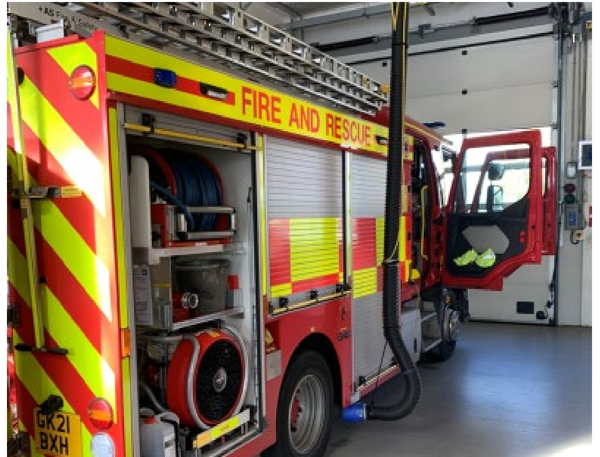
Winchester Fire Station visit with Adie Knight